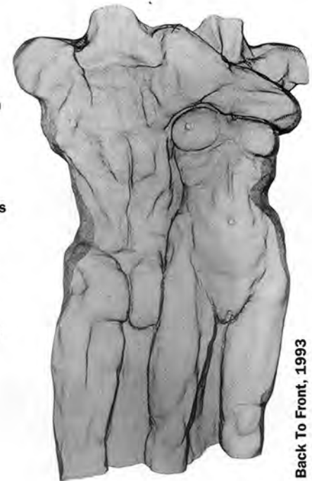
Back To Front, 1993

If you would like more detailed information of the current collection, prices, or would like to meet Begbie to discuss a special commission please send an email to different@dauidbegbie.com .